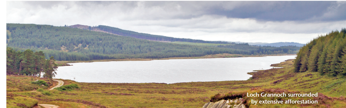
Loch Grannoch surrounded by extensive afforestation