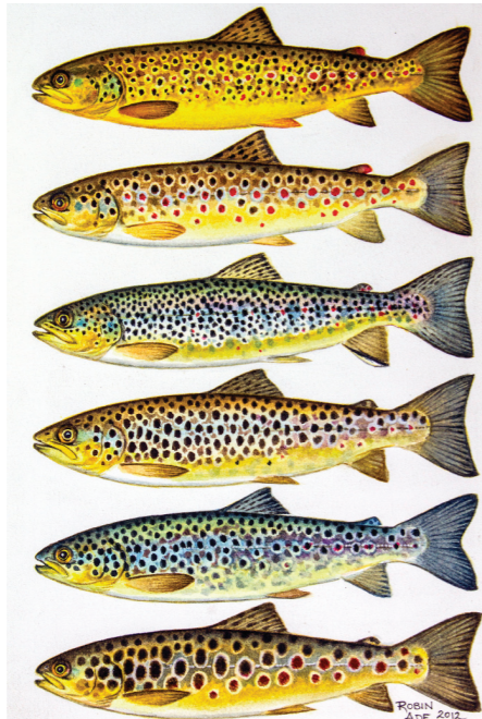
Figure 3. Some examples of colour variation in Galloway & Carrick trout

Loch Fleet was the focus for many studies on acidification from 1984-94, funded by the UK coal and electricity industries. In the first half of the 20th century, Loch Fleet contained a thriving stock of trout but catches declined markedly after 1950 and no fish were caught after 1975. Diatom records indicated that acidification started c1960 with the pH dropping from 6.6 in 1961 to 4.3 in 1975. During 1984-86, gill-netting, trapping and electrofishing confirmed trout were absent from the loch, its inflowing streams, and the outlet river for a distance of 7km downstream. Trout were present below this point, where the geology resulted in higher pH, but were prevented from passing upstream by a 5m waterfall. Experiments showed that brown trout eggs and fry could not survive in the loch water as a result of low pH, low calcium and high aluminium concentration. The land surrounding the loch was limed in 1986 and 1987 improving conditions and raising pH close to 7.0. Trout were stocked into the loch in 1987 and 1988 from three sources: below the outlet waterfall; Loch Dee; and a long established Leven-based farm strain. From 1988 to 1993 egg survival was monitored